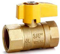
Full Port Valve