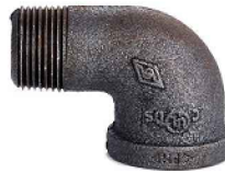
90° Street Elbow 2 pieces included