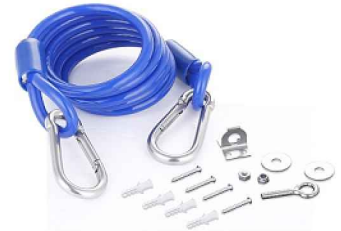
Restraining Cable Kit